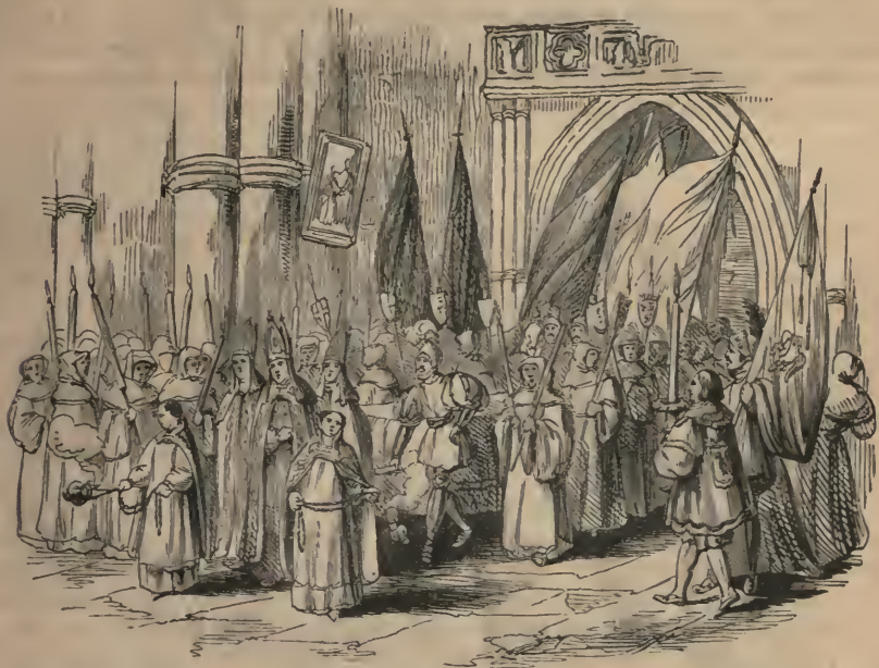
FUNERAL OF THE EARL OF FLANDERS.—Bearing the body into the Church, with an array of Priesthood, &c.

I shall now mention the regulations on the day of the obsequies, which were performed in the church of St. Peter, the names of those present as well as of the squires who supported